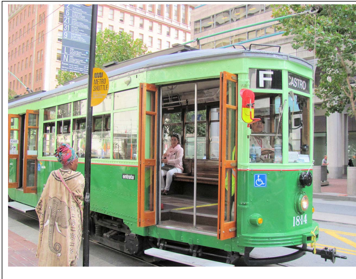
Photo Tram 01