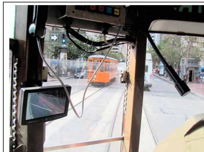
Photo 13 Date: 2016-10-11 Location: San Francisco Calif. Market Street Showing: sister tram approaching