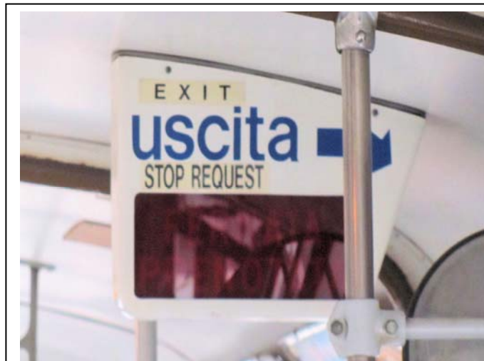
Photo 11 Date: 2016-10-11 Location: San Francisco Calif. Market Street Showing: Exit sign in Italian (with subtitles)