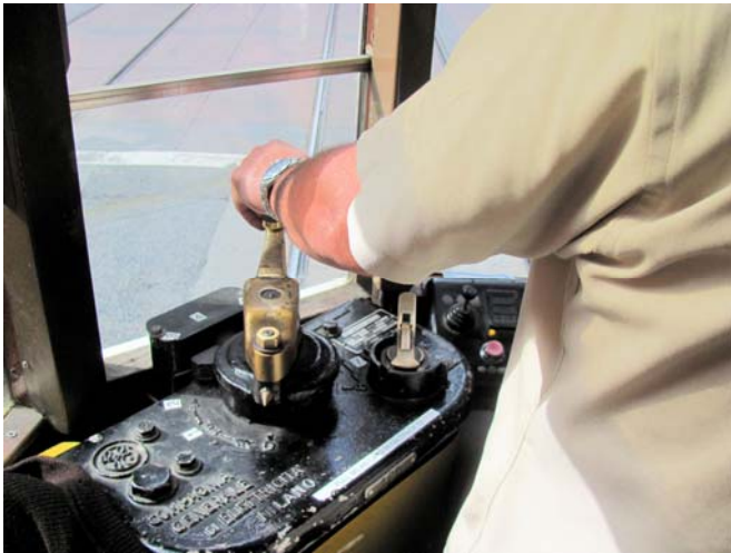
Photo 14 Date: 2016-10-11 Location: San Francisco Calif. Showing: control stand