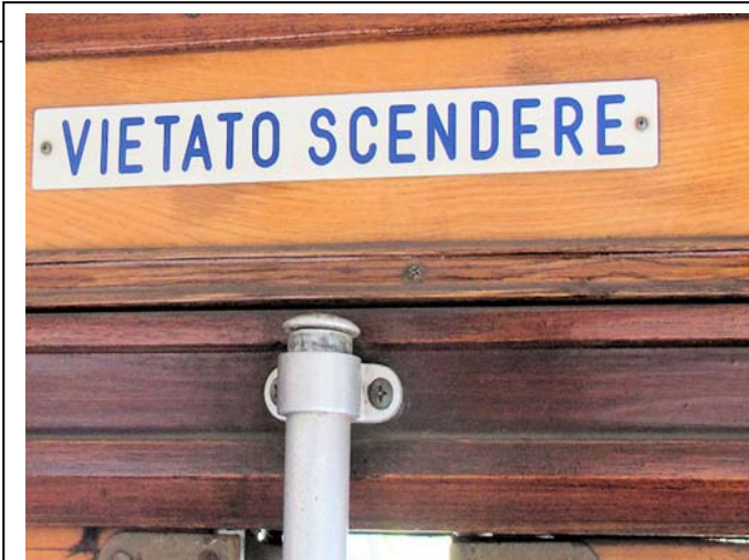
Photo 10 Date: 2016-10-11 Location: San Francisco Calif. Market Street Showing: "Descent Forbidden" sign in Italian (No Exit)