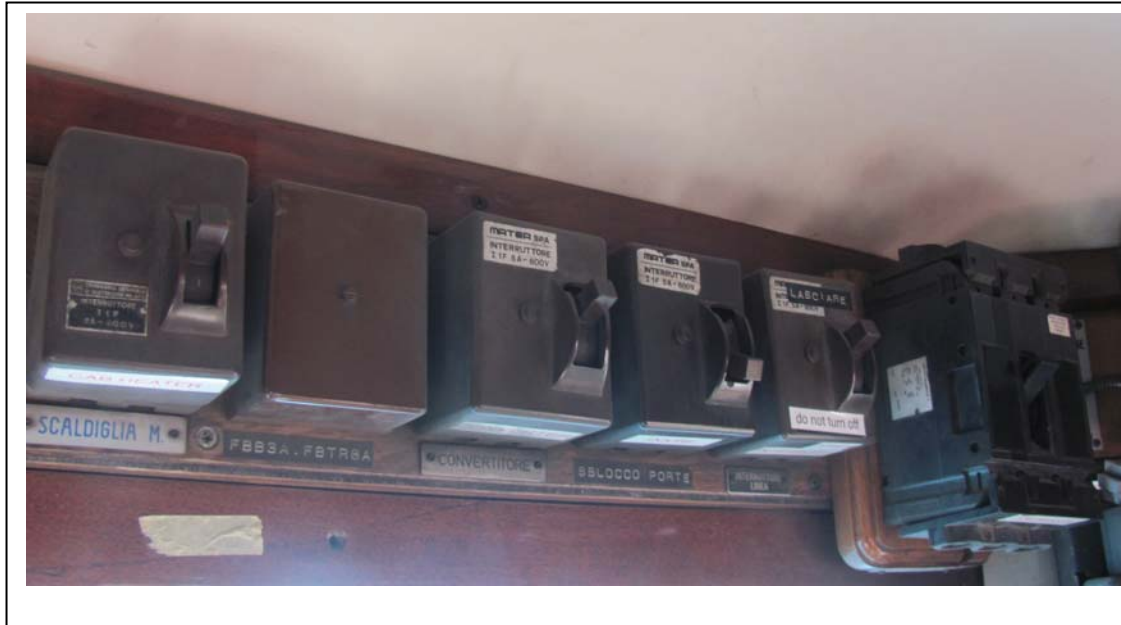
Photo 17 Date: 2016-10-11 Location: San Francisco Calif. Market Street Showing: operator switches labeled in Italian