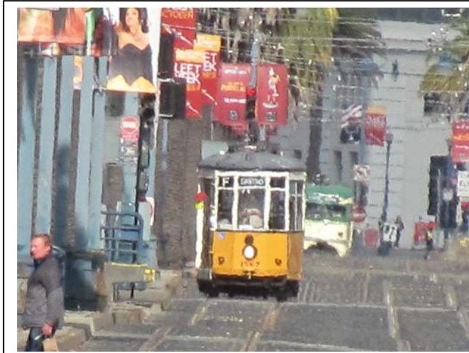
Photo 06 Date: 2016-10-11 Location: San Francisco Calif. Embarcadero Showing: Tram 1807 approach