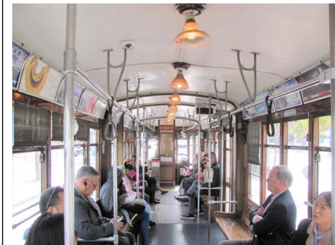
Photo 08 Date: 2016-10-11 Location: San Francisco Calif. Market Street Showing: Tram 1807 interior