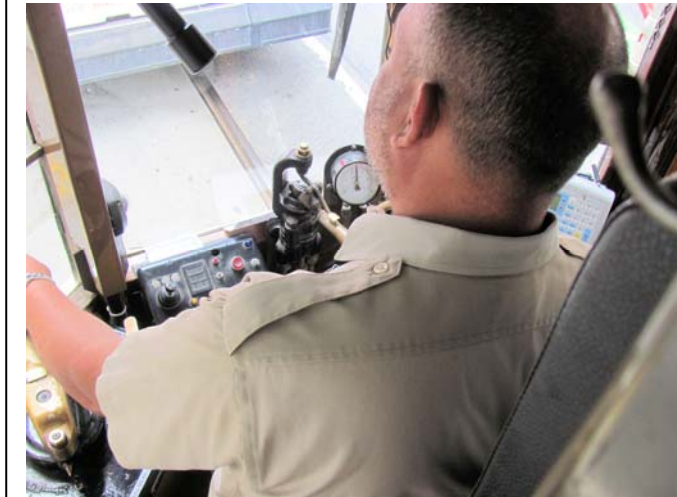
Photo 15 Date: 2016-10-11 Location: San Francisco Calif. Market Street Showing: Operator