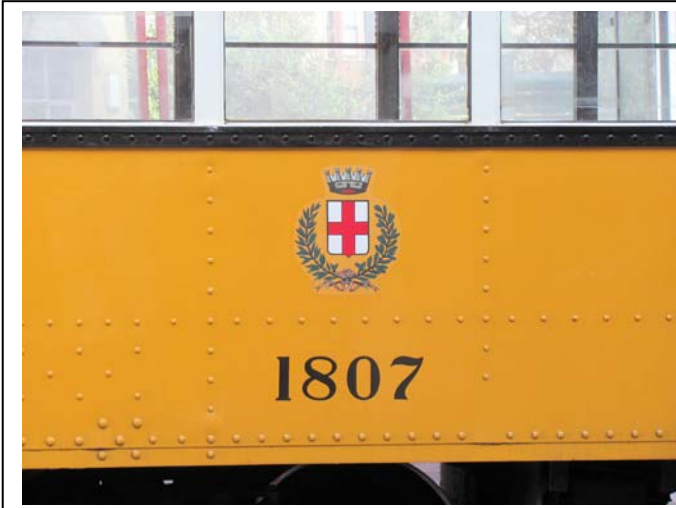
Photo 04 Date: 2016-10-11 Location: San Francisco Calif. Castro St. Trolley Terminal Showing: Coat of Arms of the Comune di Milano