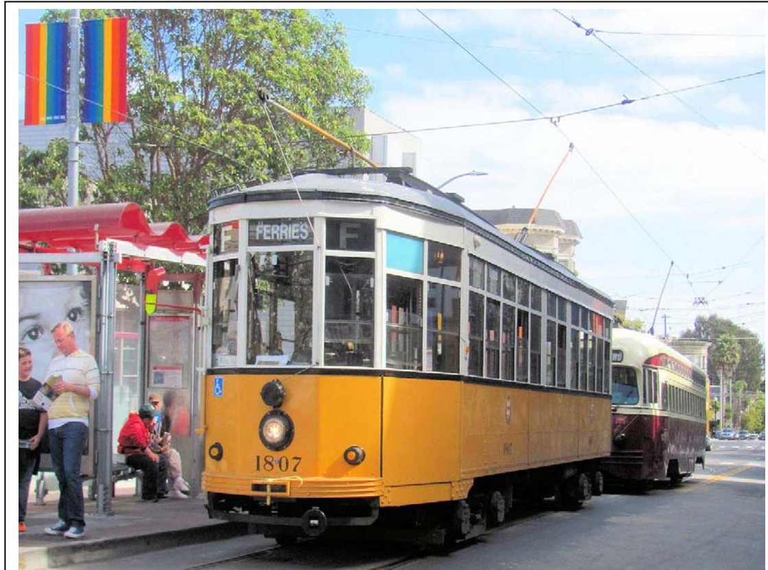
Photo Tram 03