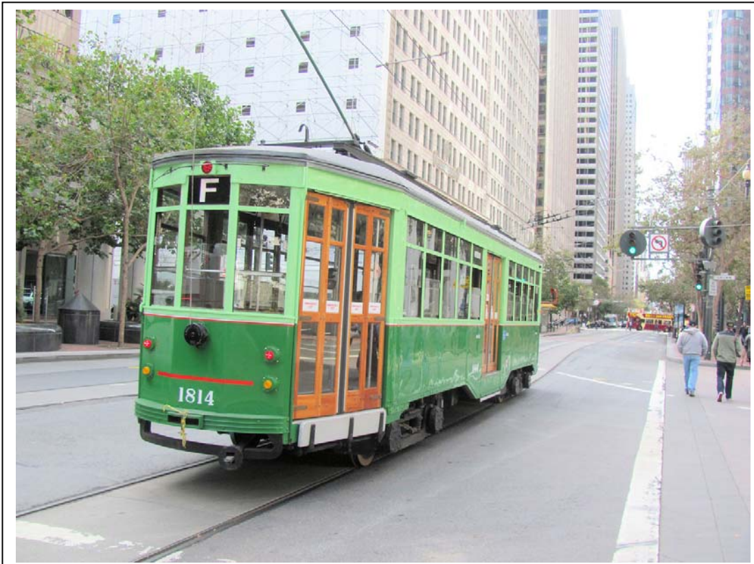
Photo Tram 02