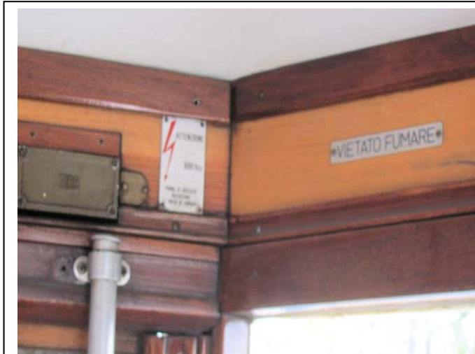
Photo 09 Date: 2016-10-11 Location: San Francisco Calif. Market Street Showing: "No Smoking" sign in Italian