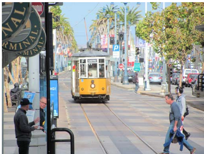
Photo 07 Date: 2016-10-11 Location: San Francisco Calif. Embarcadero Showing: Tram 1807 approach